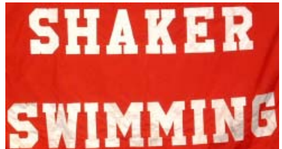
The team title was again captured by the Shaker workout group. The Lakewood workout group finished second.