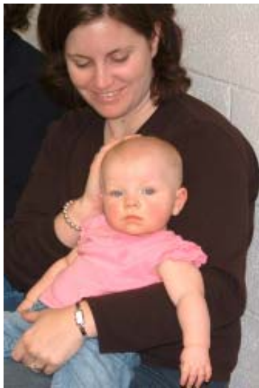
Everyone had a good time at the Lakewood Meet!