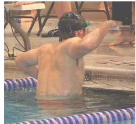
An effective exit strategy is essential.

The complete results of the Lakewood Meet and the Wooster Meet are posted on the club website: www.ohiomasters.com .