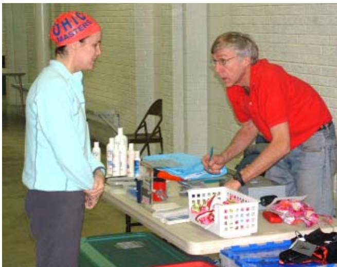
Meet and O*H*I*O Masters supporter (or sponsor) Competitive Aquatic Supply (CAS) was on hand.