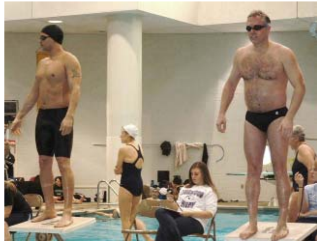
Being mentally prepared is the first key factor to having a great race.

The complete results of the Lakewood Meet and the Wooster Meet are posted on the club website: www.ohiomasters.com .