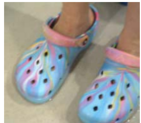
Could colorful crocs be the key to great times?